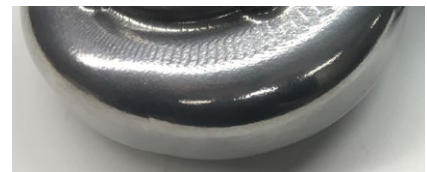
PPT Surface Finishing Reveals Intricate Pattern