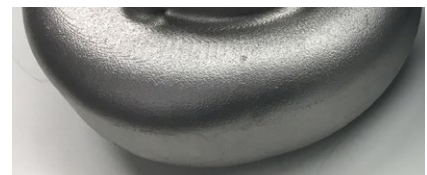
No Discernable Pattern Out of Aluminum Casting

OPERATING TIME: 135 MIN TECHNICIAN ATTENDANCE: 2 MIN RINSE TIME: 2 MIN